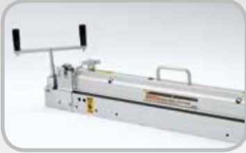
900 Series* Belt Cutter