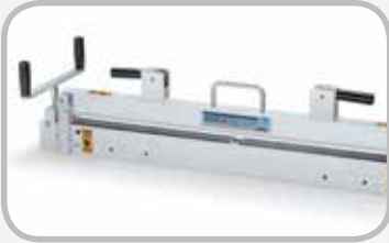
845LD Belt Cutter