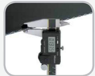
Measure belt thickness.