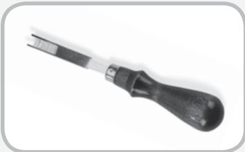
Rough Top Belt Skiver