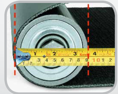
Measure smallest pulley diameter.