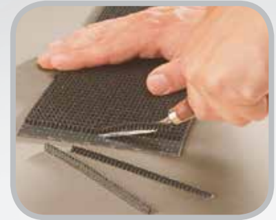
Skive impression cover.